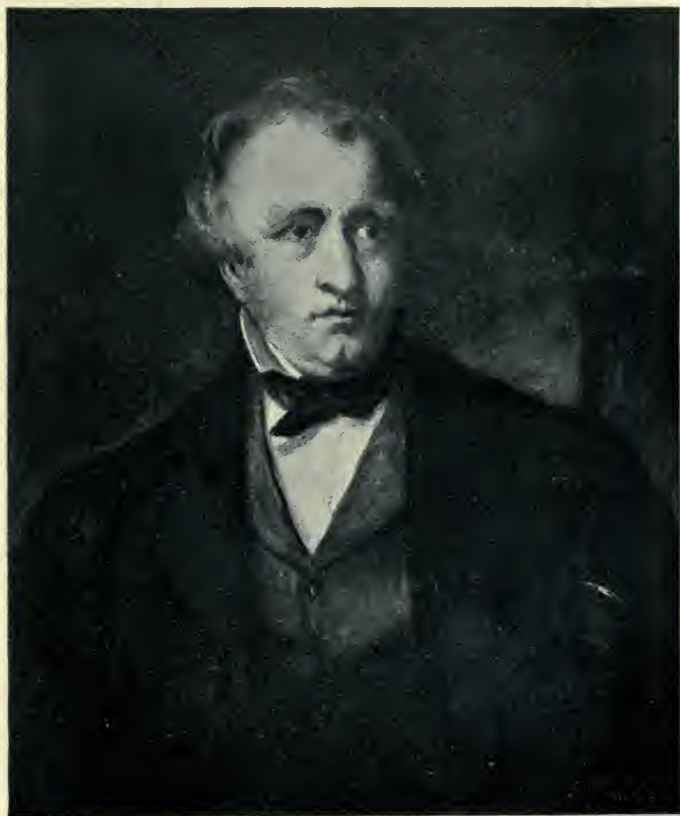
THOMAS BABINGTON, BARON MACAULAY.

From the Painting by Sir Francis Grant, P.R.A.